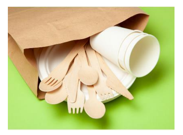
The advantages of biodegradable materials are diverse:

Directive 94/62/EC of the European Parliament and of the Council of 20 December 1994 on packaging and packaging waste stipulates that the product must decompose by 90% within 6 months.