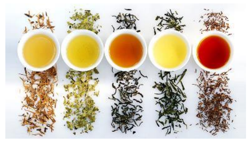
Advantages of Loose Tea Leaves over Tea Bags

Tea's versatile nature has led its following to such massive numbers. worldwide. It encompasses an entire universe of variants, blends, brewing choices and consumption methods. То cater to convenience in the modern era, the rat race and time crunch of the masses, tea has been further diversified into one broad classification: loose leaf tea and tea bags.